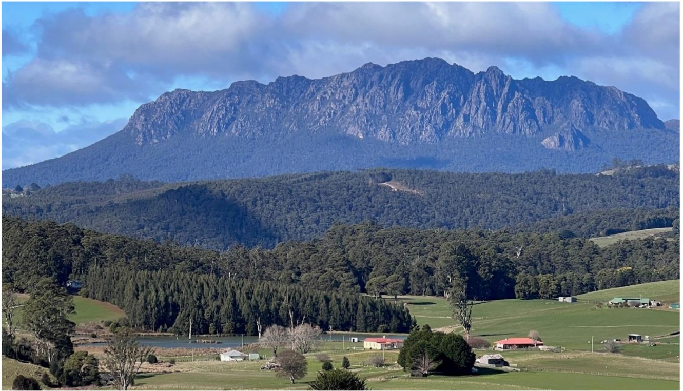
tarinimari / Mount Roland